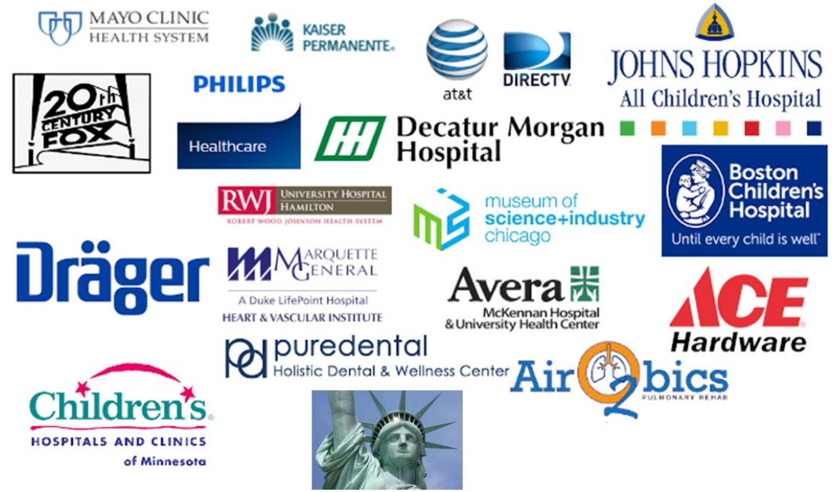
Statue of Liberty Museum

Then congratulations on your purchase of SterileLight's CountDown Plus medical-grade Antimicrobial Panel Protector for your ILLUMICIDE Disinfecting Case. You've now joined a growing community that have the additional peace of mind gained by a germ and bacteria free surface to place your beauty items on while you work.