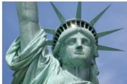
Statue of Liberty Museum